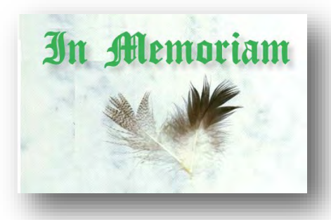
In memory of all Brother Knights that passed away throughout our councils history.